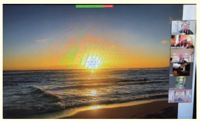
"The 1st Zoom Nenbutsu -Chanting "Namu Amida Butsu" internationally hosted by Hawaii Jodo Shu."

This reminded me of a famous episode of the Essay called "Tsurezuregusa" or "Essays in Idleness." It is one of the best known medieval collections of