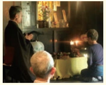
Obon at the maison of the Bois de Boulogue in Paris

So, "Namu Amita Buddha" can be translated as