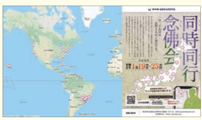
The simultaneous Nenbutsu Recitation Meet in 2021 was sponsored by Jodo Shu Young Ministers' Association. When you recited Nenbutsu and registered it, the lotus flowers were indicated on the map. .

owadays I am so grateful to have more and more opportunities to join in the online lectures and services broadcasted from Japan. Before this Pandemic, we needed to be physically there at a certain place and at a certain time in order to attend these lectures. We needed an expensive air ticket and lots of time just to go there. So we ministers in Hawaii rarely had this opportunity to take lectures while ministers in Japan have many chances to participate in the workshops and