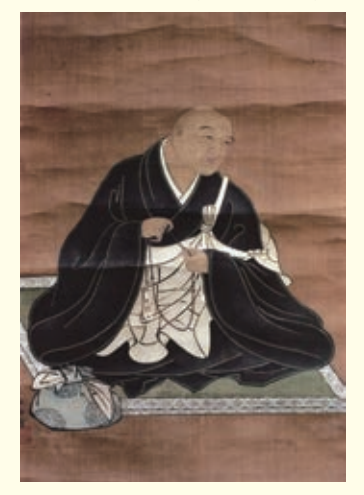
Credit for the cover portrait of Hōnen Shonin: Saishoin Temple, Tokyo