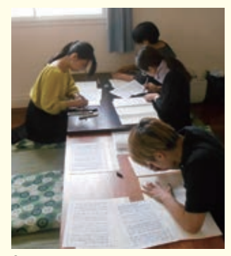
Sutra copying at Amidaji

terms with life. Life was no longer intolerable. Civil strife, disease and famine persisted but one could begin to accept these harsh realities with equanimity. An end to suffering was achievable. And furthermore, it did